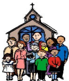
Our Church Family