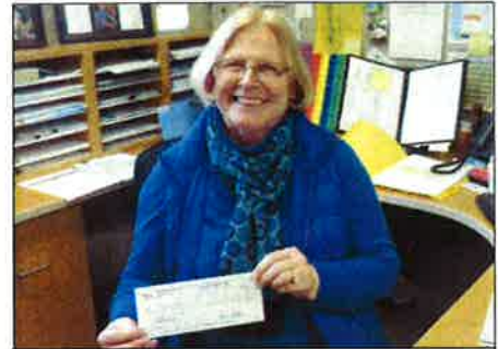
$40,000.00 Check from the Ray and Kay Eckstein Charitable Trust

And another blessing arrived in late February via the Ray & Kay Eckstein Charitable Trust worth $40,000 (a grant I wrote and submitted in