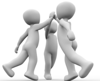
Creating a Culture of Safety