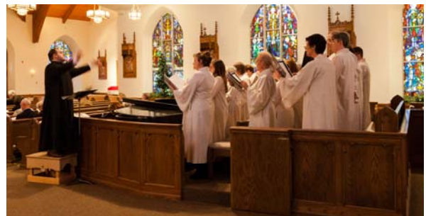
The Saint Monica Parish Choir, Lessons & Carols 2014

The Saint Monica Parish Choir will conclude the 2014-2015 Choral Season on Sunday, 7 June, the Solemnity of the Most Holy Body and Blood of Christ (Corpus Christi), at the 9:30 a.m. Mass. Please join me in thanking the talented volunteer musicians of our parish for their dedication and many, many hours of service throughout the year. The cantors of the parish will continue to lead our sacred music throughout the summer months while the choir enjoys a much deserved break!