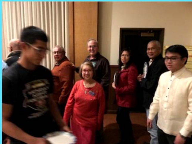
Photos from the Simbang Gabi reception held December 23, 2017, following a nine-day Advent Novena.