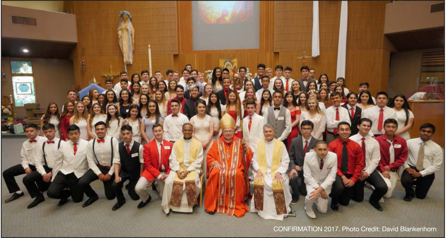
CONFIRMATION 2017. Photo Credit: David Blankenhorn