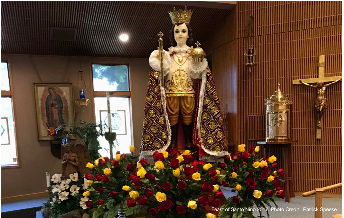
Feast of Santo Niño 2017.