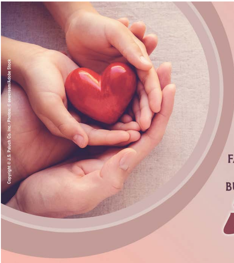
Copyright © J.S. Paluch Co. Inc.